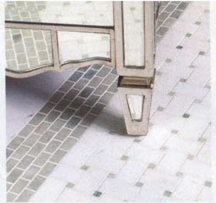
ABOVE: The mirrored vanity stool reflects a tile "rug" composed of white basketweave tiles and a light green mini-brick border.

Victoria + Albert's Roxburgh tub also offers the look—at a price in the $2,000 range; www.vandabaths.com . Find similar styles and prices at Sunrise Specialty; www.sunrisespecialty.com .