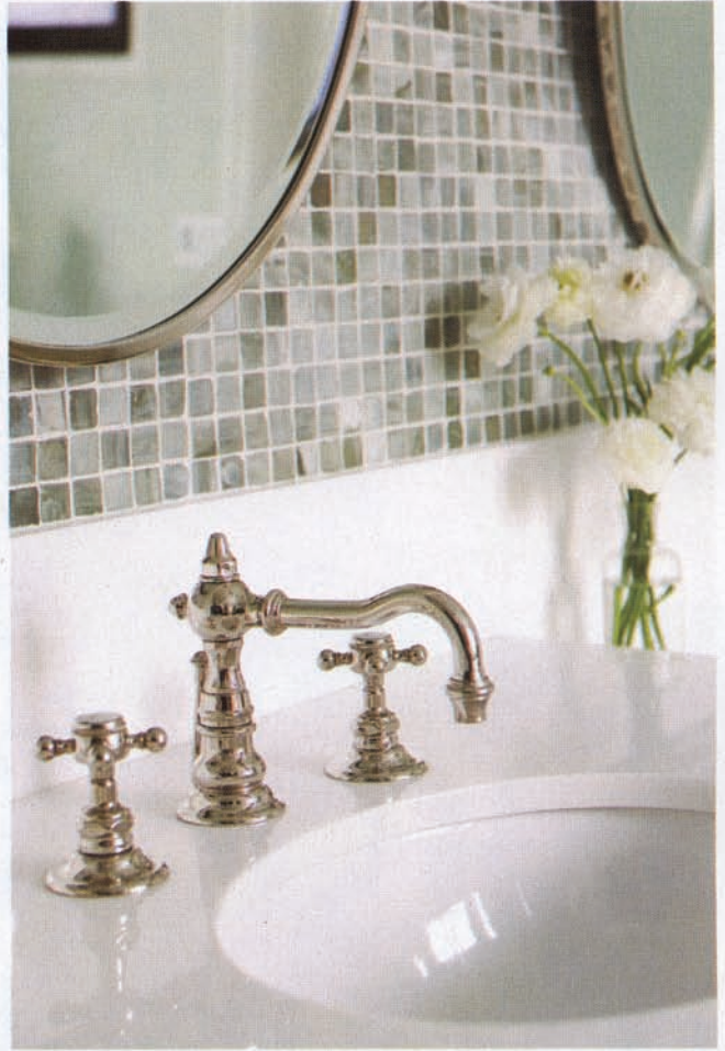
ABOVE LEFT: Designer Brooke Gardner wanted the shower to take advantage of light from the bathroom window and have the appearance of no frame. She used glass partitions to keep heat and steam in without compromising an open, seamless feel. ABOVE RIGHT: Traditional-style fixtures in nickel provide the perfect finishing touch for the bath. OPPOSITE: Multilevel countertops add interest to the vanity and cater to Lisa's comfort, whether she's standing at the sink or sitting at the makeup area.

intact. Walls were painted a cool celadon and framed with classic white crown molding and low wainscoting. Floors were covered with 12×12-inch white Thassos marble tile, accented by a white-and-green tile “rug” and complemented by slab white marble on the window ledge, shower, and vanity top. “I wanted to keep the materials the same throughout the bath to get a soothing feel,” Gardner says.